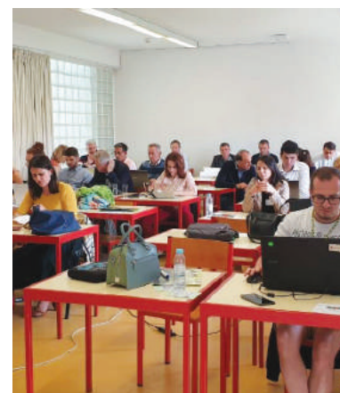
■ MEETING IN LISBON