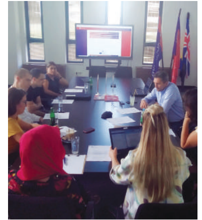
■ FOCUS GROUP SSST, SARAJEVO