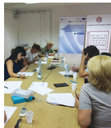
■ FOCUS GROUP UKIM, SKOPJE

On July 9th, a delegation from the National Erasmus Office (NEO) Albania conducted the 2nd local monitoring visit for the Erasmus+ KA2 CBHE Project, "Enhancing and Validating service-related competences in Versatile learning environments (e-VIVA)".