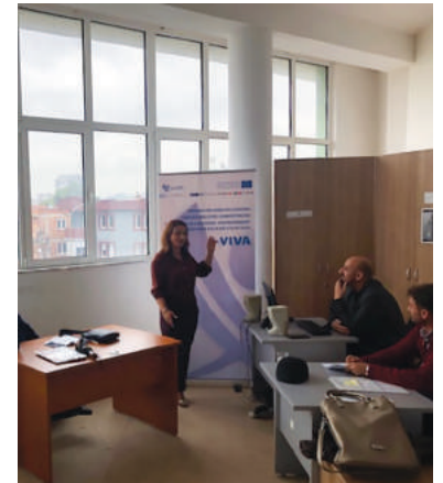
■ FOCUS GROUP UMT, SKOPJE

The SSST' research team from the Computer Science and Information Systems Department, as part of the ongoing e-VIVA Erasmus+ CBHE project organized focus group and interviews on service-oriented competences with representatives from academia (staff and students) and business sector. This activity was held in the framework of WP implementation activities and the collected data were process and presented in the institutional, national and transnational reports.