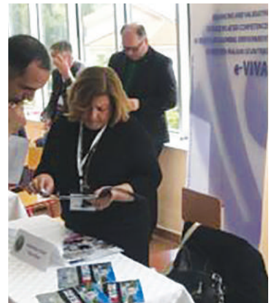
■ ERASMUS+ INFO WEEK, ELBASAN