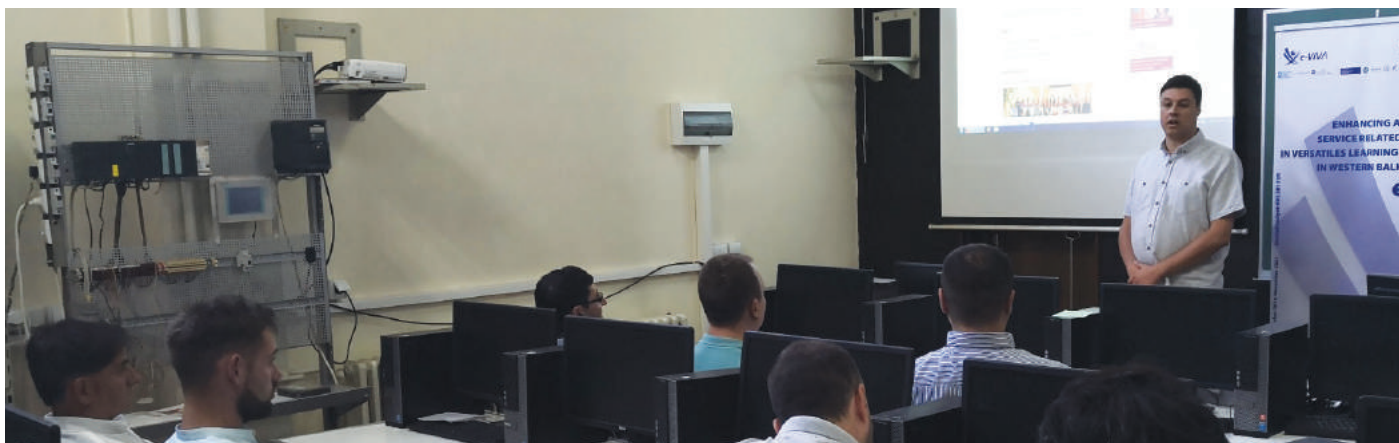
■ e-VIVA PROJECT AT UNI, NIS