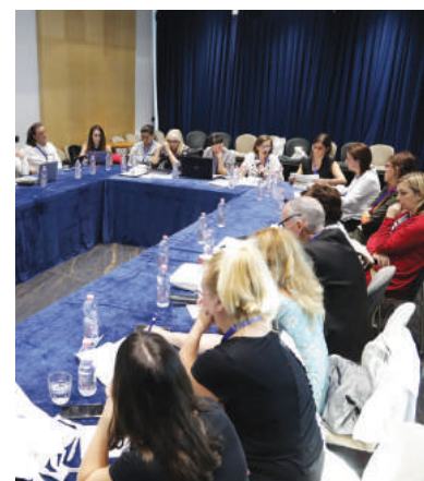
■ CLUSTER MEETING, DURRES

“Representatives of the Erasmus + Albania Office attended this event and they introduced students and staff with many opportunities offered by the Erasmus + Programme of the European Union.