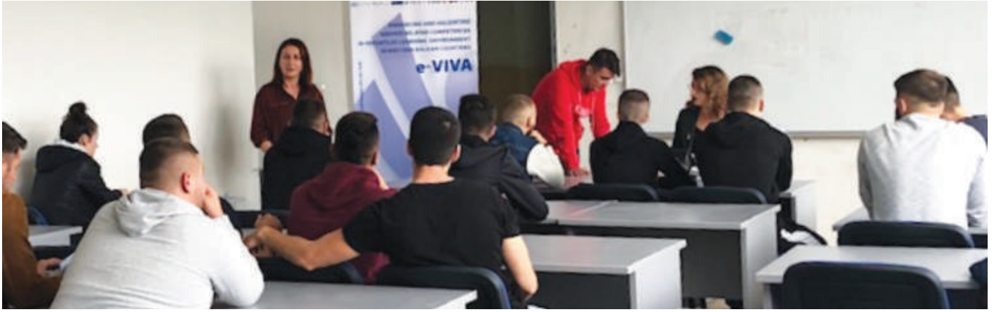
■ FOCUS GROUP UMT, SKOPJE