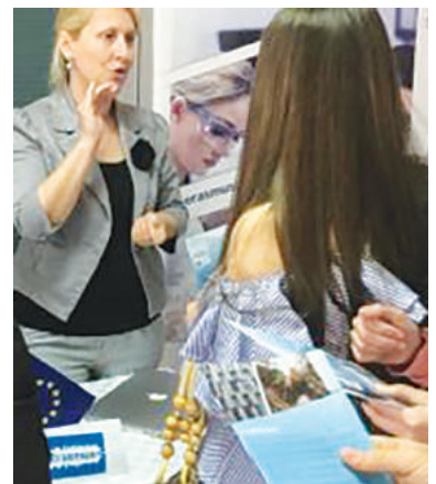
■ ERASMUS+ INFO WEEK, ELBASAN

It was an activity full of entertainment and information dedicated to Europe and with a relatively high number of participants from Albanian HEIs (students and staff).