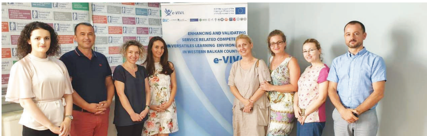
■ MONITORING VISIT AT UET, TIRANA