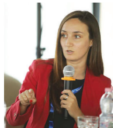
■ CLUSTER MEETING, DURRES

“Representatives of the Erasmus + Albania Office attended this event and they introduced students and staff with many opportunities offered by the Erasmus + Programme of the European Union.