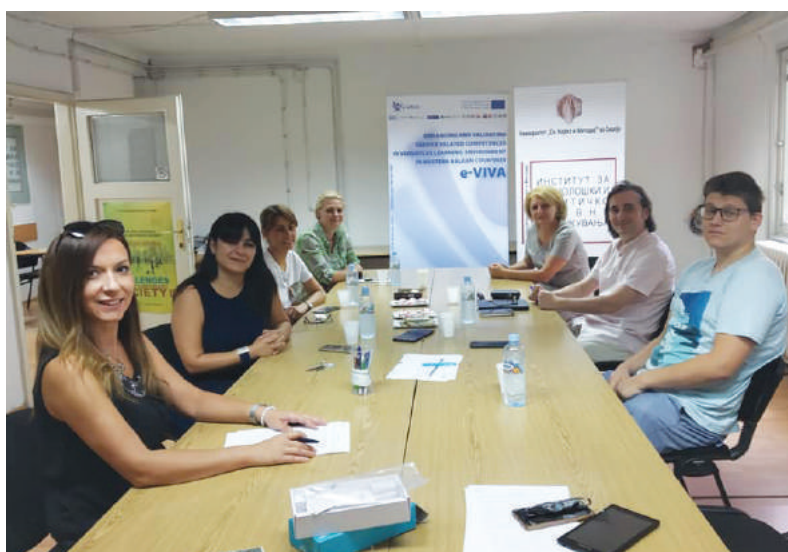
■ FOCUS GROUP UKIM, SKOPJE