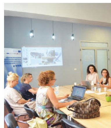
■ MONITORING VISIT AT UET, TIRANA

e-VIVA research team at the Institute for Sociological, Political and Juridical Research UKIM organized a focus group with staff and students as well as business sector representative focused on service-oriented competences. This activity was held in the framework of WP implementation activities and the collected data were processed and presented in the institutional, national and transnational reports.