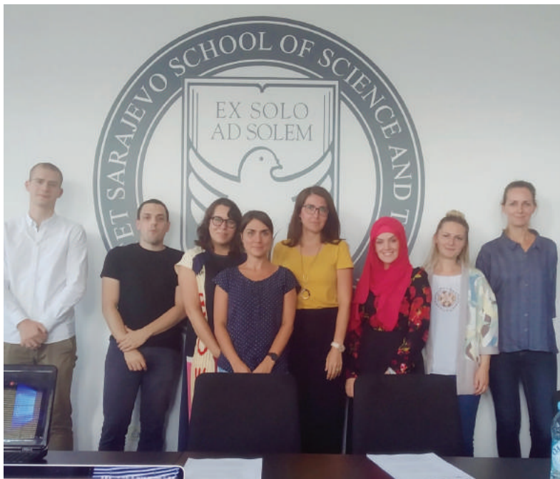
■ FOCUS GROUP SSST, SARAJEVO

“ This activity was held in the framework of WP implementation activities and the collected data were process and presented in the institutional, national and transnational reports.