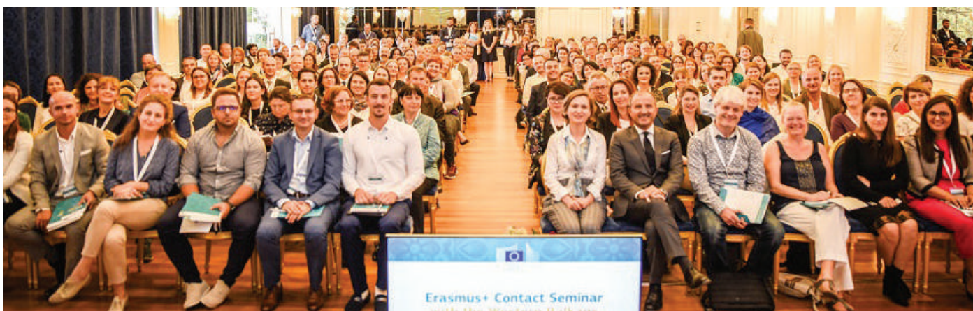
■ CONTACT SEMINAR, TIRANA