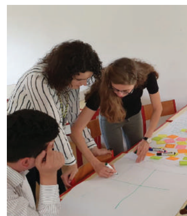
■ MEETING IN LISBON