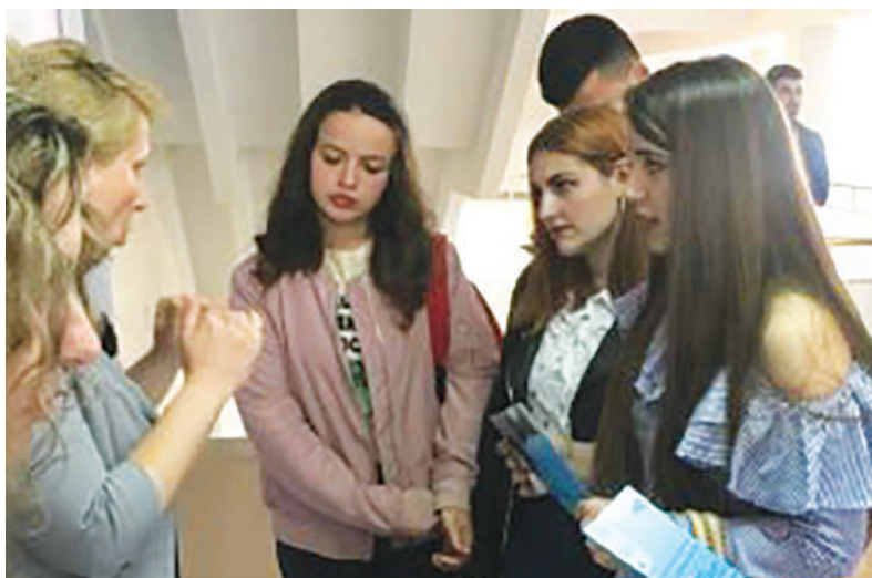
■ ERASMUS+ INFO WEEK, ELBASAN