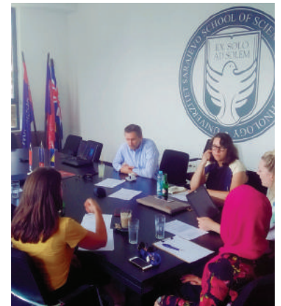
■ FOCUS GROUP SSST, SARAJEVO

“ This activity was held in the framework of WP implementation activities and the collected data were process and presented in the institutional, national and transnational reports.