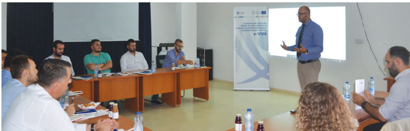
■ FOCUS GROUP UKZ, GJILAN