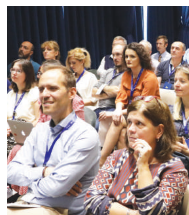
■ CLUSTER MEETING, DURRES

e-VIVA Project was presented at the ‘Regional Cluster Meeting on CBHE projects’ impact in the Western Balkans (WB)’ which gathered the coordinators of the CBHE projects implemented in WB and was organized on 22-23 October 2019 in Durres (Albania). The meeting was organized by the Education, Audiovisual and Culture Executive Agency (Brussels), and the National Erasmus+ Office in Albania. The meeting aimed at discussing the EU funded projects/programmes impact on the WB HE sectors in terms of regional cooperation, modernisation, accessibility and internationalisation of the HE, CBHE projects producing an impact on higher education systems and promoting reforms at national and/or regional level, as well as convergence with the EU developments in higher education. Additionally, the cluster meeting aimed at facilitating exchanges of good practice and networking of CBHE projects to enhance their quality, impact and sustainability.