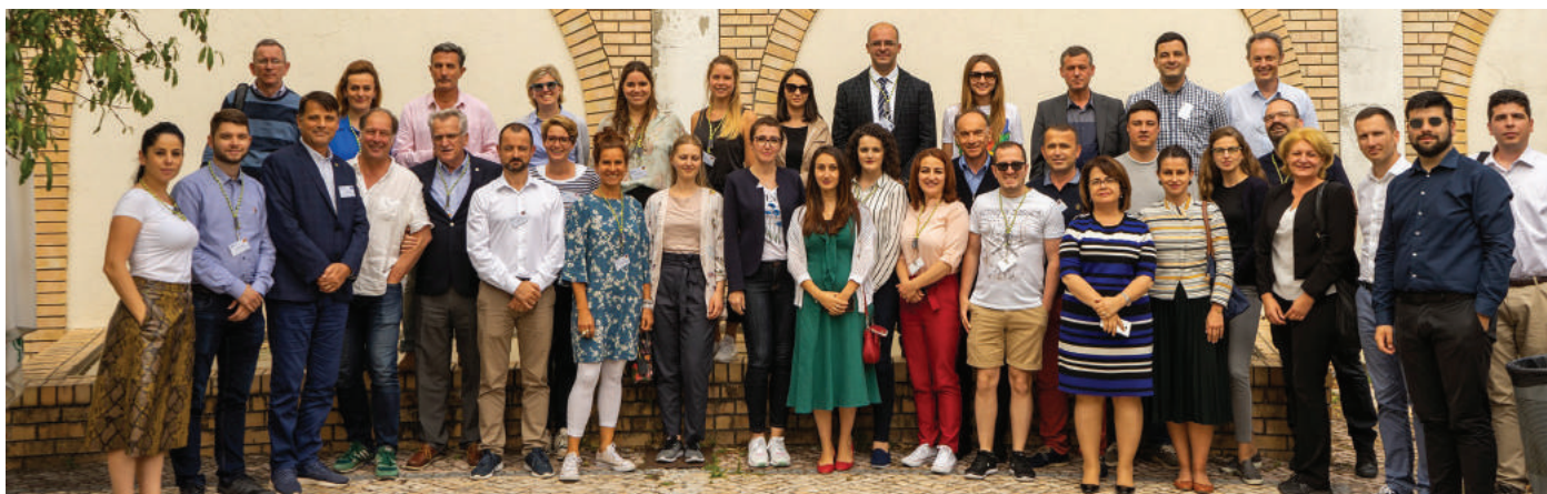
■ MEETING IN LISBON