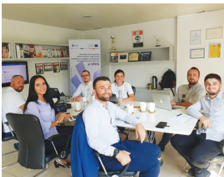
■ FOCUS GROUP UC, PRISTINA

e-VIVA research and implementation team at Universum College and "Kadri Zeka" University Gjilan in Kosovo met to discuss the upcoming project tasks and coordinate actions related to the successful implementation of WP1 activities. Additionally, partners discussed about the upcoming dissemination activities and they agreed for more coordinated efforts to ensure a wider outreach.