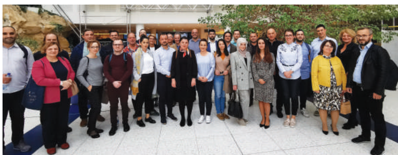
■ MEETING IN VIENNA

From 24th to 25th of October 2019, the third project meeting was organized at the premises of the host institution, die Berater in Vienna. This event included both Management Meeting and training of the e-VIVA Staff. Management Meeting agenda was Management Meeting agenda was focused on several key issues related to the e-VIVA Project implementation such as WP1 deliverables and transnational report, manual and descriptive pattern of the learning project/activity, inventory of sub-competences, reference systems, didactic frame, competence framework, learning objects and modules, catalogue of suitable assessment systems, etc. The 2nd day was entirely dedicated to three consecutive training sessions provided by the Programme countries partners.