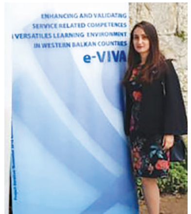
■ EU VILLAGE 2019

During the week of 6-10th of May 2019, which coincides with the European week, the University of Elbasan "Aleksander Xhuvani" (UEAXH) organized the Erasmus+ Info Week with the participation of many partner universities from different countries. Various activities were organized, including an Erasmus+ Fair. An important part of this Fair was the presentation of the e-VIVA Project as an innovative CBHE initiative for UEAXH staff and students. Participants were introduced with the purpose and objectives of this project, the project partners, as well as the activities planned to be implemented in the upcoming months.