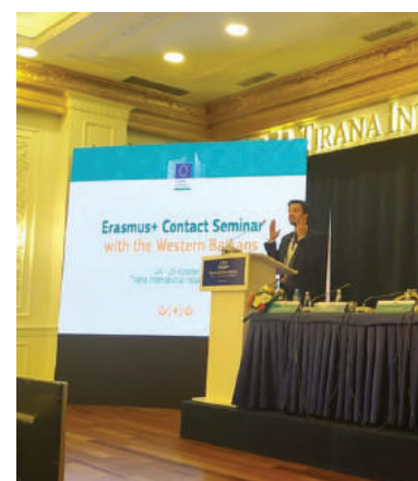
■ CONTACT SEMINAR, TIRANA

“ The aim of this event was to increase the number of applications within the region under the next Erasmus+ call for proposals by offering concrete networking opportunities.