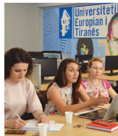
■ MONITORING VISIT AT UET, TIRANA