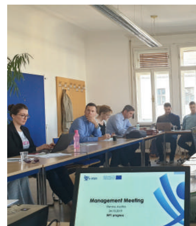
■ MEETING IN VIENNA