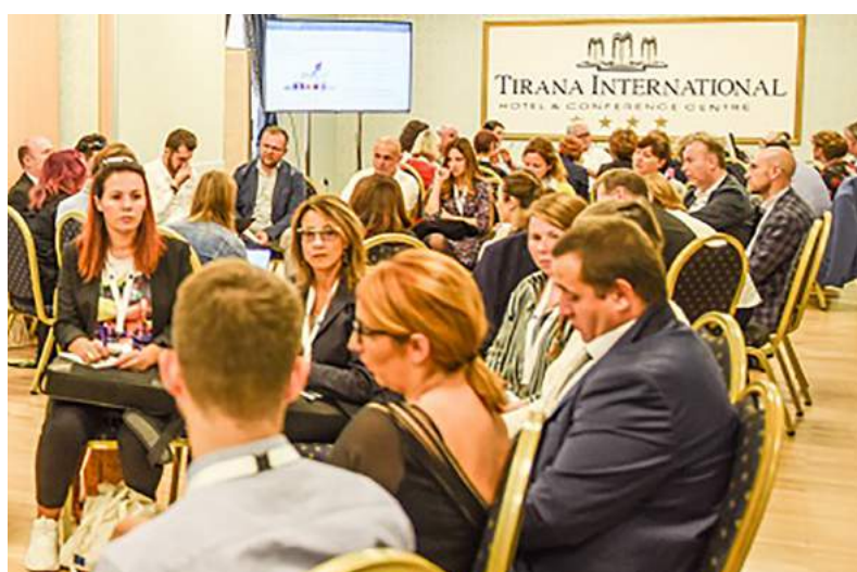
■ CONTACT SEMINAR, TIRANA