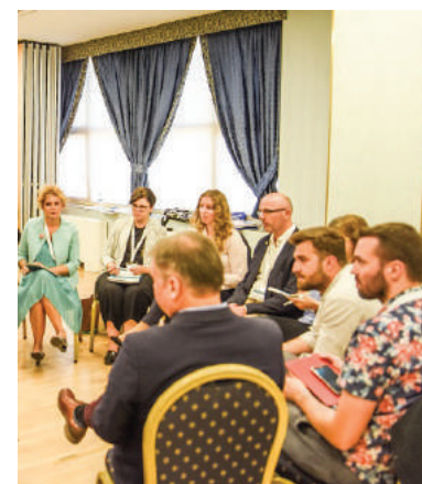
■ CONTACT SEMINAR, TIRANA

“ The aim of this event was to increase the number of applications within the region under the next Erasmus+ call for proposals by offering concrete networking opportunities.