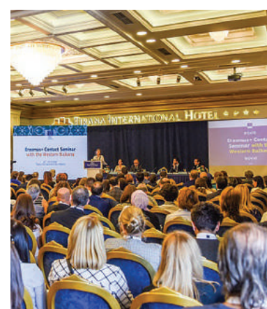
■ CONTACT SEMINAR, TIRANA